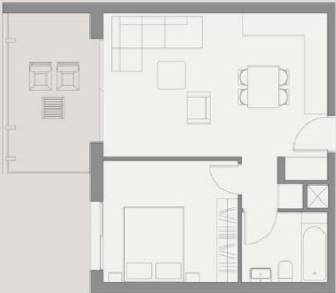
1 ST - 4 TH FLOOR