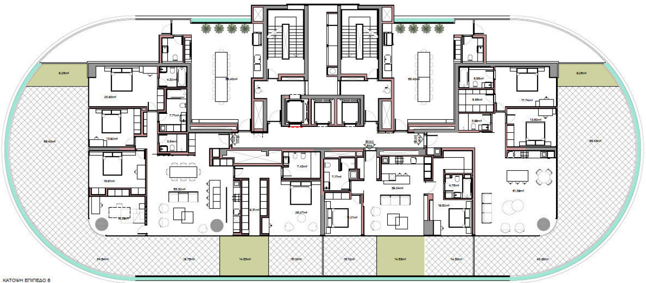
ΚΑΤΩΤΗ ΕΠΙΠΕΔΟ 0