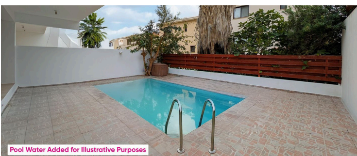
Pool Water Added for Illustrative Purposes