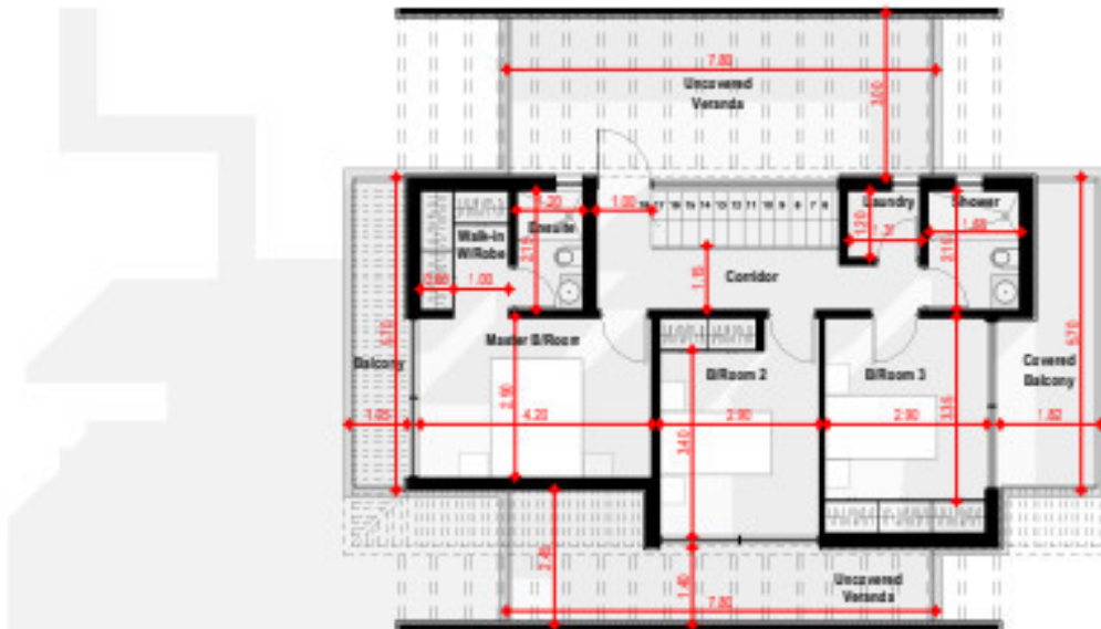
2 First Floor Plan - Villa 02 1 : 100