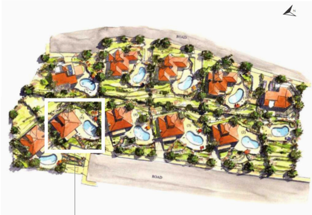
AKAKIA VILLA 6