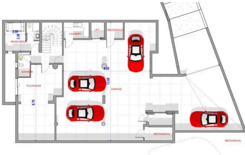
PRELIMINARY GROUND FLOOR