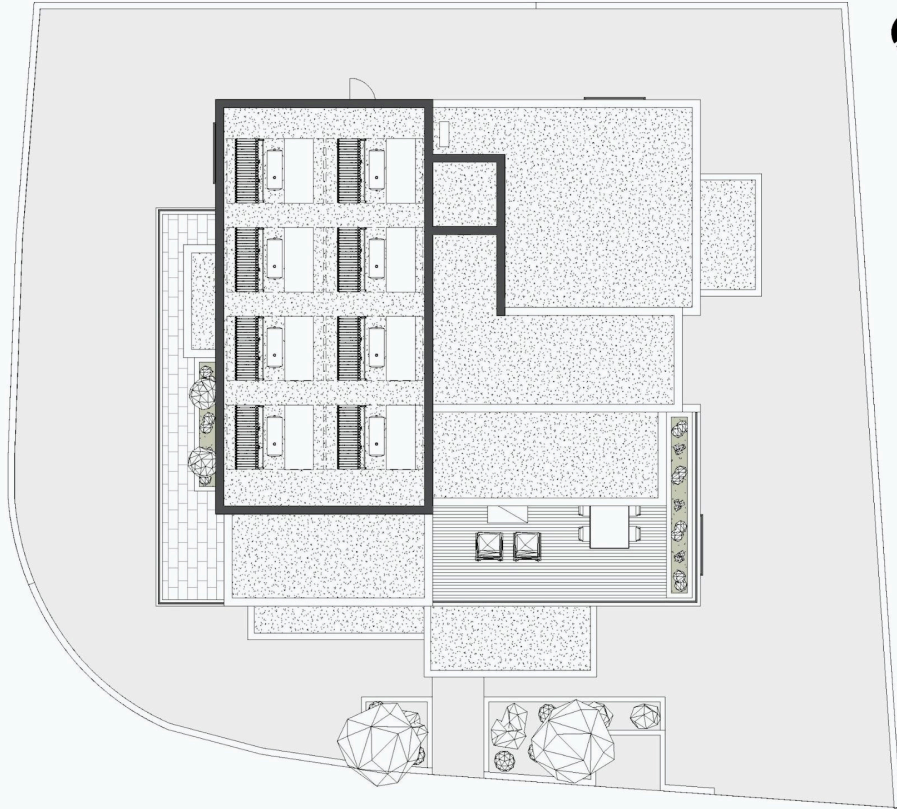
AKAKIA - ROOF PLAN