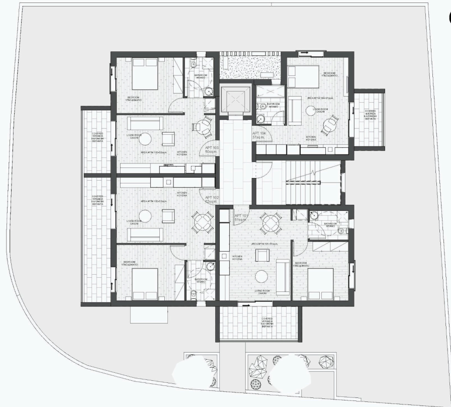
AKAKIA - FIRST FLOOR