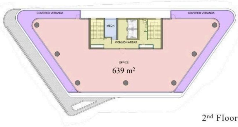
2 nd Floor -6 th FLOOR