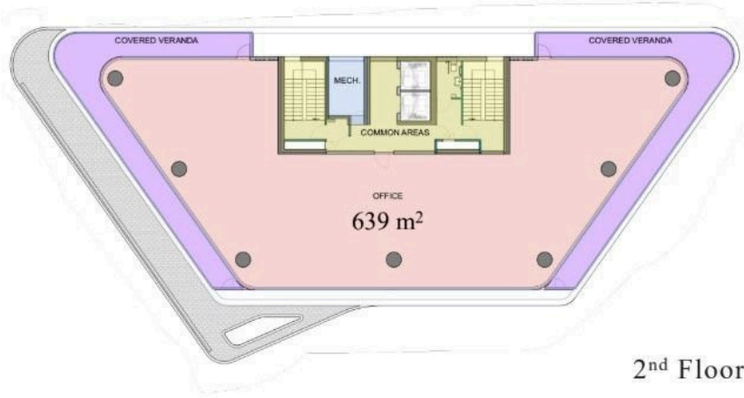
2 nd Floor -6 th FLOOR