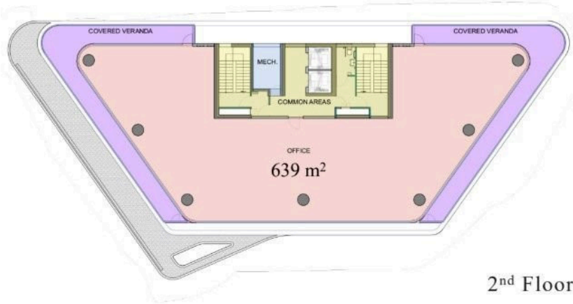
2 nd Floor -6 th FLOOR