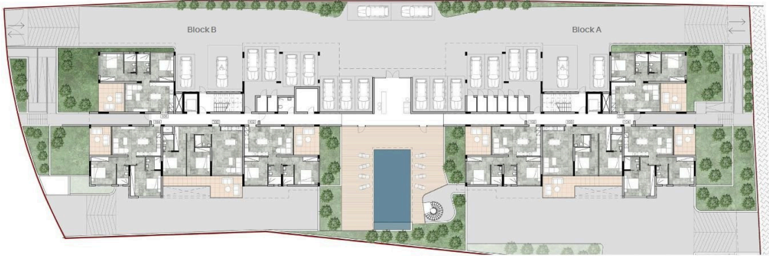
Block B Ground Floor