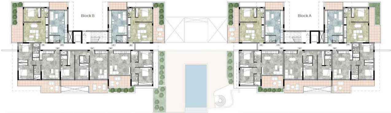
Block B 1st Floor